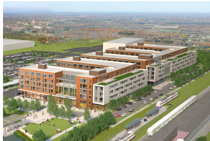
Clockwise Left to Right: 611 E. University Avenue - Ann Arbor, MI (Collegiate Development & Campus Apartments), USC Campus Village - Columbia, SC (Greystar), College Park Metro Apartments - College Park, MD (Gilbane)